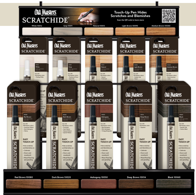
Assortment # 10031 Display product on slatwall, pegboard, or countertop (16" high x 15" wide x 10.75" deep)