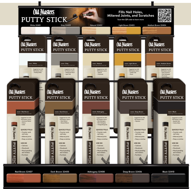
Assortment # 32430 Display product on slatwall, pegboard, or countertop (16" high x 15" wide x 10.75" deep)